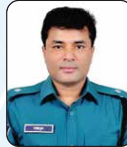
Speaker- Md. Najmul Islam BPM(Sheba) Additional Deputy Police Commissioner Cyber Security & Crime Division Counter Terrorism & Transnational Crime Dhaka Metropolitan Police-Bangladesh Topic- Role of the Youth Nurses in Countering Cyber Crime