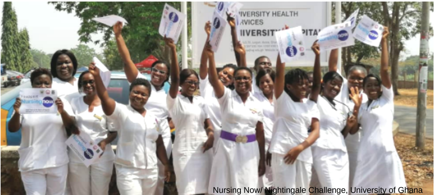
Nursing Now/ Nightingale Challenge, University of Ghana