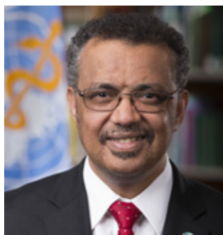
Dr Tedros Ghebreyesus Adhanom, Director General, World Health Organization