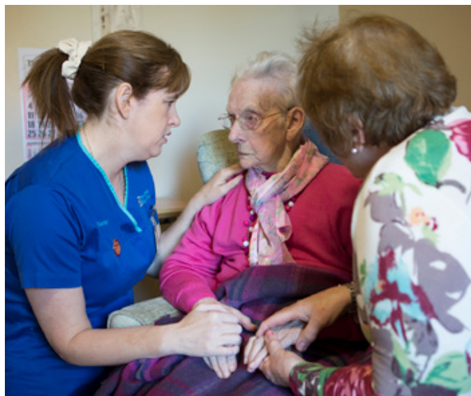
The QNI/Nursing in Focus

But Covid has also reminded us that nurses are too