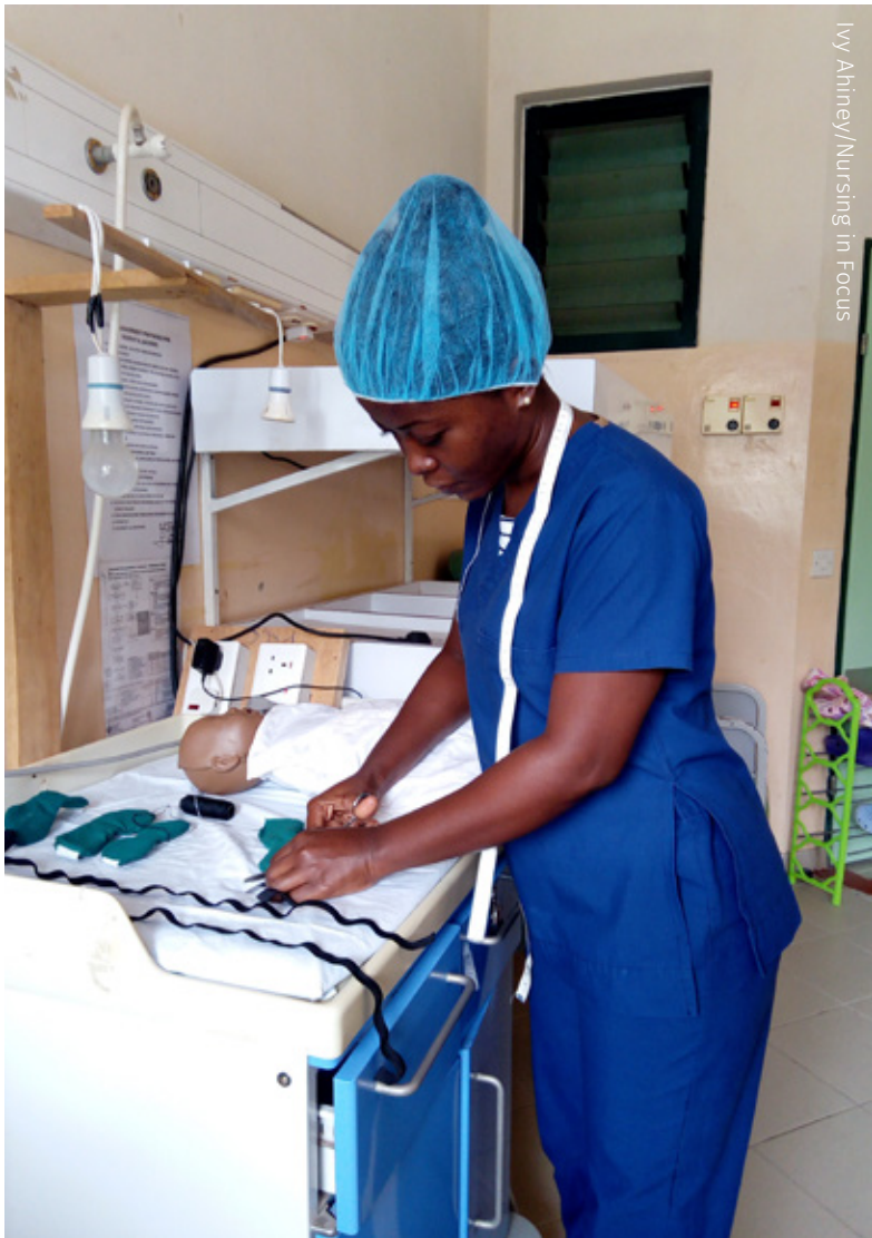
Ivy Ahiney/Nursing in Focus