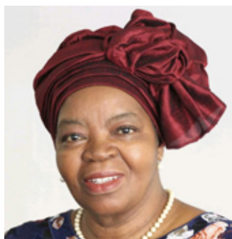
Professor Sheila Tlou, Co-Chair, Nursing Now Campaign Board