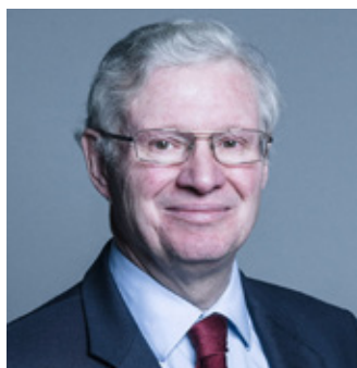
Lord Nigel Crisp, Co-Chair, Nursing Now Campaign Board

It is what happens locally in communities, cities and countries around the world that is, of course, of most importance and we congratulate and thank everyone involved in this campaign in all parts of the world for your great work now – and in the future.